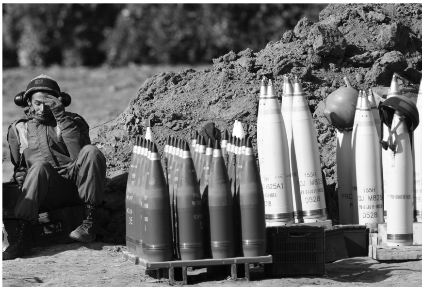
An Israeli soldier sits next to pallets of artillery shells outside the northern Gaza Strip, 5 January 2001. The light-colored shells are M825A1 white phosphorous projectiles, which the Israel Defense Forces denied using until confronted with photographic evidence.

observers; and to block targeting equipment. WP causes rapid, deep, painful chemical burn injuries similar to napalm and simultaneously causes delayed wound healing. Spraying WP fires with water increases the fire's intensity. The munitions are legal under international law when used for their intended purposes, but their use in densely populated urban/civilian areas may legally constitute a war crime.